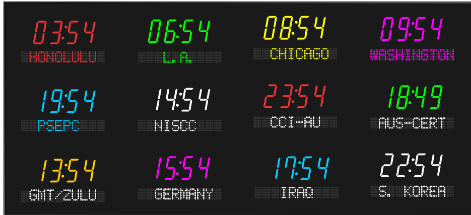
Model 6612Q - 4.0" time, 2.0" zone labels, 12 zones